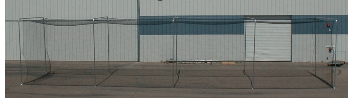
Enjoy your new batting cage from West Coast Netting!

Feel free to use the Velcro straps and extra "S" hooks to attach the net to the frame, as needed, to get the desired fit for your location.