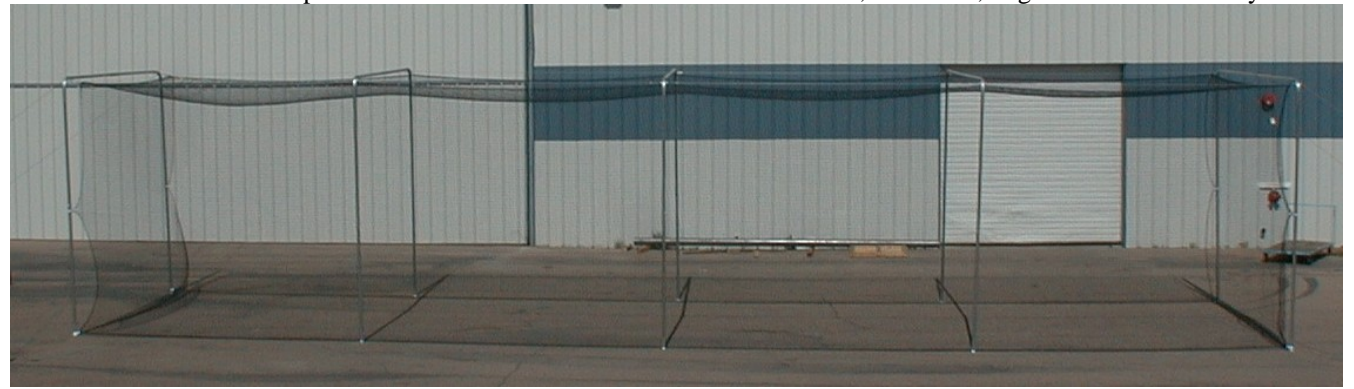
Enjoy your new batting cage from West Coast Netting!

Feel free to use the Velcro straps and extra "S" hooks to attach the net to the frame, as needed, to get the desired fit for your location.